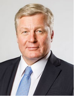
Dr. Bernd Althusmann, Minister of Economic Affairs, Employment, Transport and Digitalisation