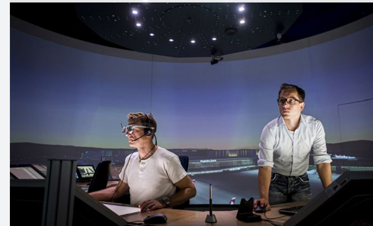
Remote Tower - the German Aerospace Center, DLR

Niedersachsen is Northern Germany's hotspot for General and Business Aviation. Supported by the excellent infrastructure available to the industry, we support your General Aviation business development and innovation.