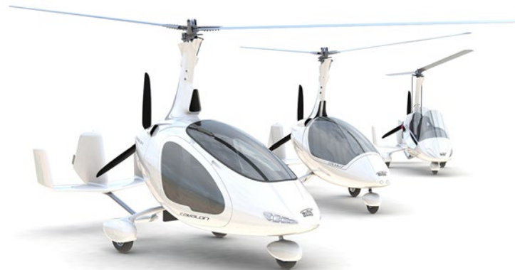
The design-awarded gyroplane family made in Hildesheim