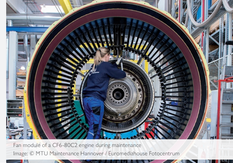
Fan module of a CF6-80C2 engine during maintenance

Our highly competitive manufacturing technology drives productivity and flexibility and automates the aerospace production worldwide.